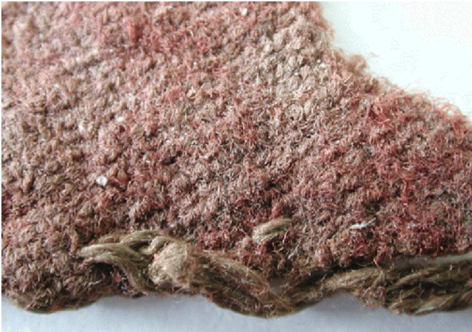
Figure 7. A sample of cut velvet that tested positive for cochineal and madder (101147).