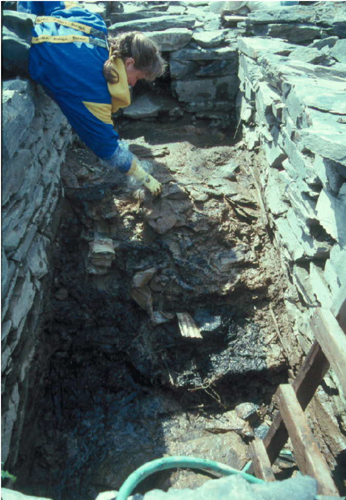
Figure 2. Excavation of the Area C privy; note the moist soil matrix.