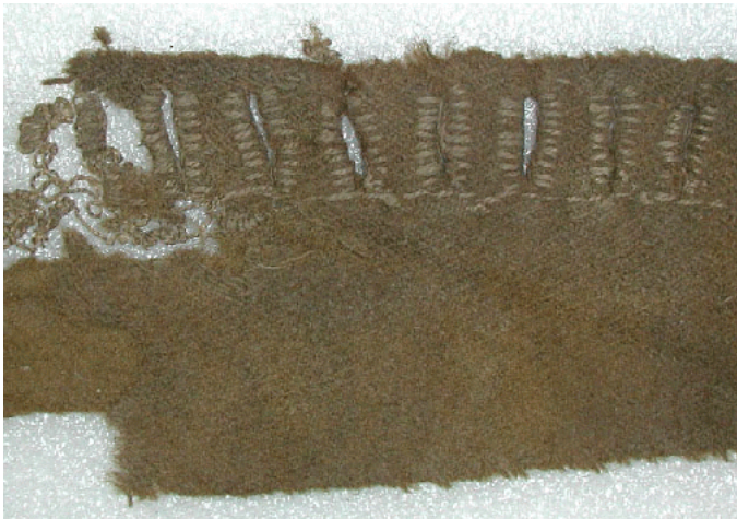
Figure 10. A wool doublet front section with buttonholes trimmed in silk threads (78130).

privy finds) and human feces. This layer dates later than Event 116, possibly from the 1640s or 1650s. The two uppermost Events represent the end of the third quarter of the 17 th century. Event 50 was deposited on top of Event 111 sometime before 1673. It held 12% of the textile finds. The privy was capped by Event 49 which corresponds with the destruction of the waterfront warehouse in the Dutch raid of 1673. This last layer held 14% of the textile finds.