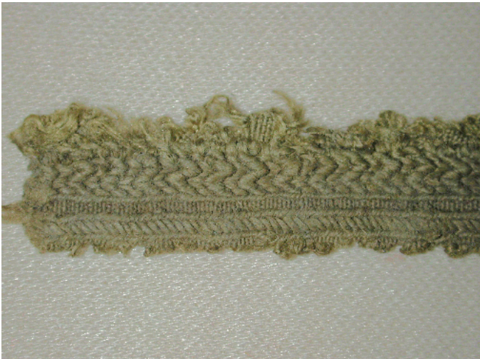
Figure 8. Silk trim dyed with weld (87101).