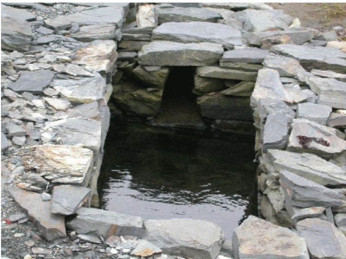
Figure 3. The privy was originally designed to flush with the rise and fall of the tide.