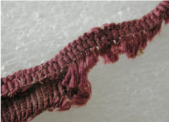
Figure 9. Silk trim dyed with cochineal (124936).