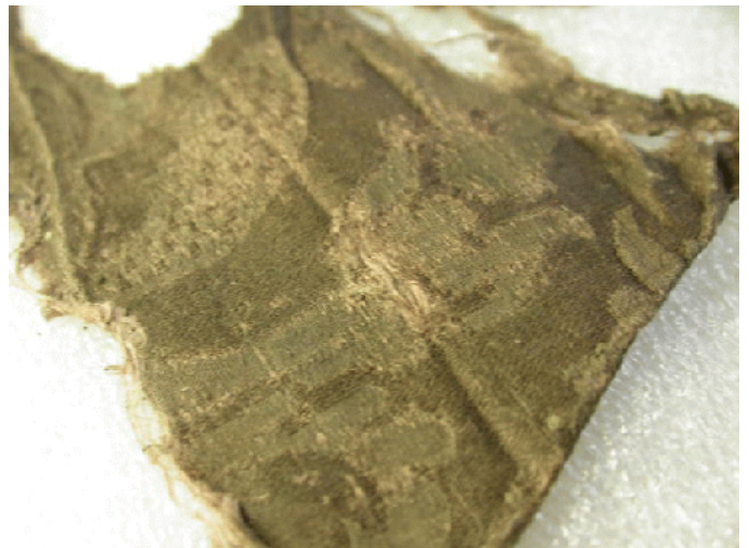
Figure 6. Fragment of silk damask showing leaf pattern (127294). This fragment tested positive for cochineal and madder.