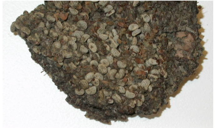
Figure 4. Textile fragment with seed deposits on the surface indicating its reuse as a "clout" (112649).