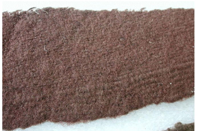
Figure 5. A fragment of fulled wool of the "Old Draperies" (101202).