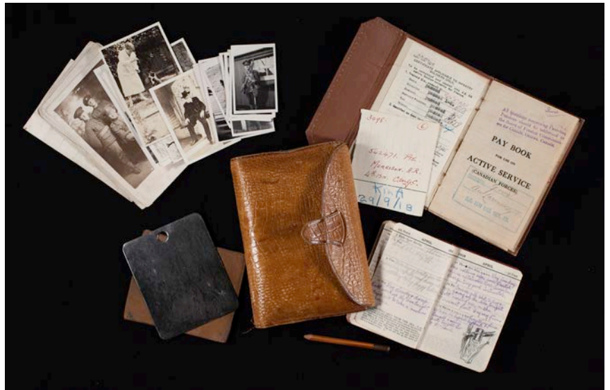
Figure 2. Wallet and all its contents. Archives of Manitoba, Norman Matheson fonds P4352, file 2.

systems. A screen view or printout from a digital file will not show physical evidence of the changes that have been made to it, so it is critical to ensure and to maintain the authenticity and reliability of these records. The same binary code can represent a wide variety of records formats such as databases, architectural plans, films, photographs and personal correspondence. The steady advance of digital record-making and record-keeping has therefore accelerated the theoretical shift away from subject-based and media-based analyses to archival appraisal based on maintaining functional context.