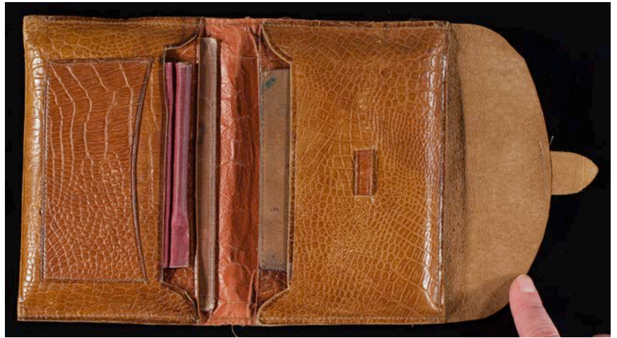
Figure 1. Wallet, opened to show how items fit inside. Archives of Manitoba, Norman Matheson fonds P4352, file 2.

Analogue records originate and persist in a single physical form, and modifications to analogue records can be detected through examination of changes to the media such as a visible splice in an audio tape. Digital files can only manifest themselves as representations assembled through the encoded interactions of hardware, software and computer operating