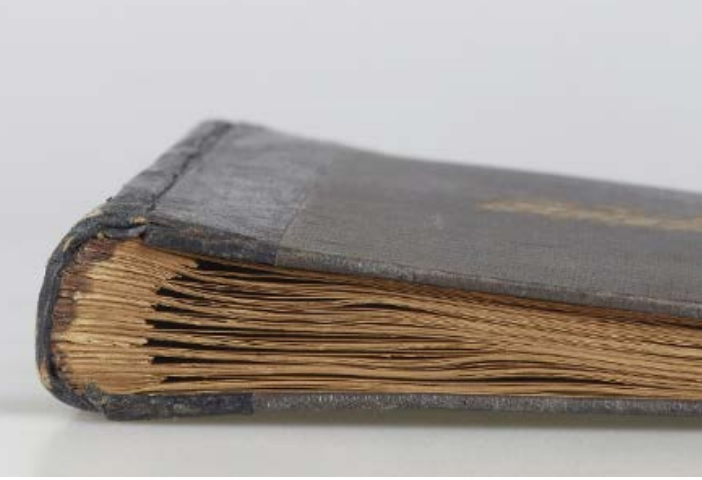
Figure 10. Tail view of spine before treatment (left) showing exposed board and distorted spine. Tail view of spine after treatment (right) showing somewhat improved spine shape and covered board edges.

damaged board edges covered ( Figure 10 ). On the exterior cover, the book shows little change ( Figure 11 ) due to the nature of the rebacking and the overall minimal approach. The change is most notable in the "feel" or opening characteristics of the volume and the no longer imperiled samples. The botanical specimens are more firmly attached to the substrate but are still able to move with the arc of the pages.