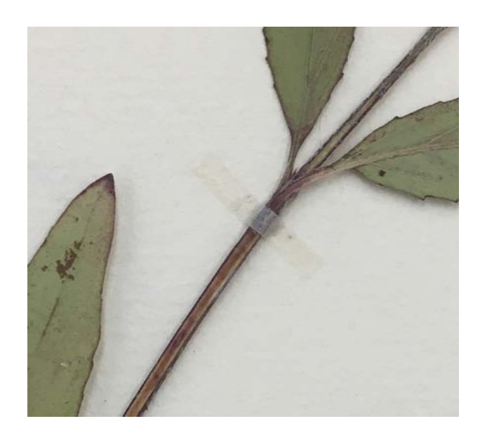
Figure 6. Diagram of solvent-set tissue strap (left) and detail image of solvent-set strap on a mock-up test specimen (right).