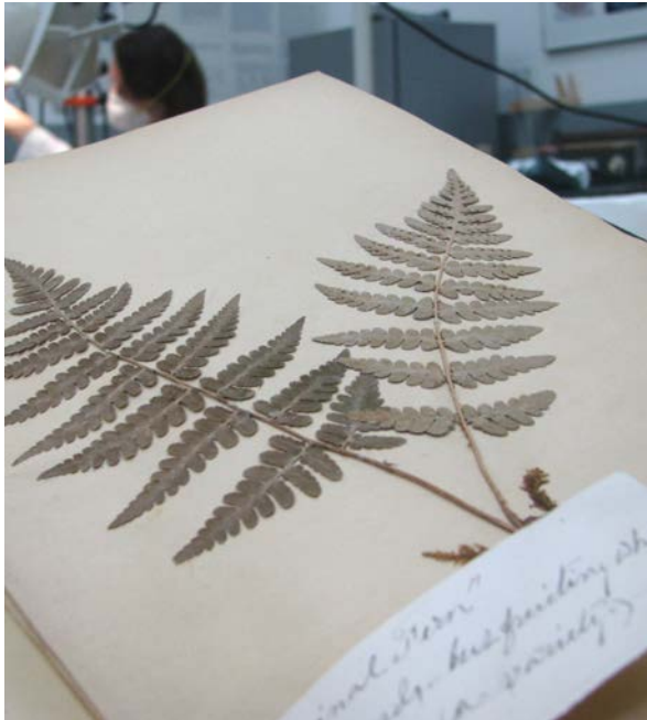
Figure 7. Christine McNair adhering solvent-set straps in place around detached specimens, using tweezers to gently set the adhesive around the stem (left). Specimen after attachment using solvent-set straps (right).