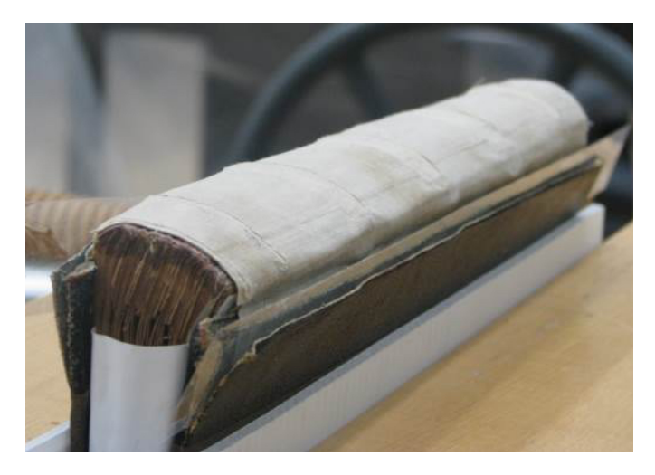
Figure 5. Reattachment of boards using spine linings and hollow, prior to recovering with toned Japanese paper and original spine piece. The leather sides are still lifted and a Mylar strip sits between the cover and the leather to protect the sides from staining.

The spine and spine leather were then pasted out with very dry wheat starch paste. The spine piece was adhered and aligned onto the back of book, wrapped in white elastic bandages, and left to dry overnight under weight. The sides were put down with strong paste and the abraded edges of the leather sides were toned in with black watercolour pencil crayon over toned kozo paper. The corners were firmed using toned, mid-weight kozo tissue adhered with wheat starch paste.