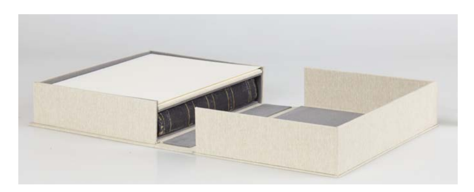
Figure 8. The book in its custom clamshell box.

volume. The interior of the box was lined with Plastazote closed cell cross-linked polyethylene foam. As well, a compensatory wedge was made with Davey board and covered in book cloth. The wedge permits the enclosed samples to sit flat in the box and holds the book in place. The remaining distortion of the spine would not otherwise allow the book to remain in place.