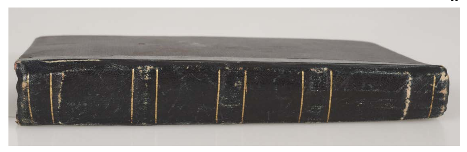
Figure 2. Distorted spine before treatment. The tail of the spine on the left side of the image shows typical gravity drag from being shelved vertically. Tears in the leather are also visible along the joint.

The cloth sides showed abrasion and some soiling. The corners of the boards at both the head and tail of the book were worn and bent, and the cloth had frayed leaving the millboard exposed.