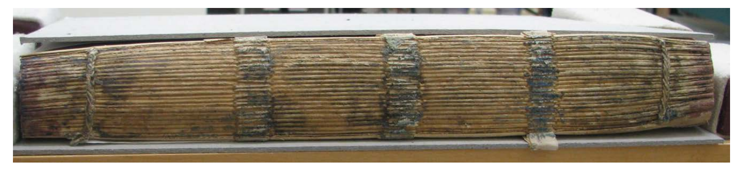
Figure 4. Exposed spine after removal of leather spine piece and excessive animal glue. Original supports and heavy kettle stitches are visible.

AIKO tissue was toned using acrylic paints and pencil crayons (black, burnt sienna, indigo), followed by a layer of SC6000 (an acrylic polymer and wax emulsion produced by the Leather Conservation Centre), and then a further layer of indigo and black pencil crayons. The toned paper was adhered with strong wheat starch paste under the lifted leather sides and slightly over the joint and then left to rest overnight under light weights.