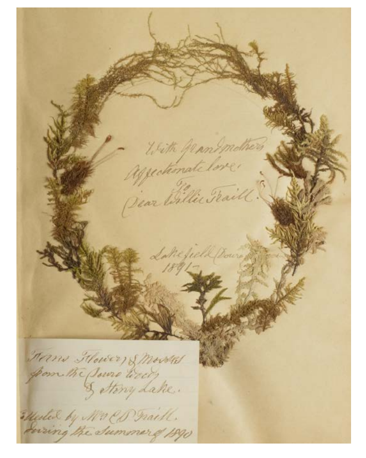
Figure 1. Dedication wreath at beginning of the volume.

The album's significance is tied to Catharine's work assembling the book with her handwritten notations, as well as to the presence of some potentially unusual or endangered plant specimens, as noted by a botanical expert in Peterborough.<sup>2</sup> The goal of the treatment was, therefore, to stabilize the very fragile specimens and improve the overall opening characteristics of