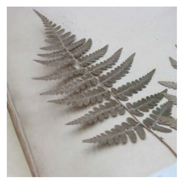
Figure 3. Example of a detached botanical specimen in the Catherine Parr Traill scrapbook.

The adhesive had failed on many of the specimens which were lifting from the page or had become completely detached ( Figure 3 ). This led to the phenomena of loose samples "trailing" the pages when turned, particularly those that were