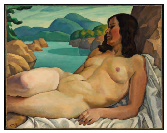
Figure 3. Edwin Holgate, Nude in a Landscape , c. 1930, oil on canvas, 73.1 cm x 92.3 cm, purchased 1930, National Gallery of Canada, Ottawa. © Estate of Edwin Holgate.

In order to avoid opening too many test windows, FTIR analysis was limited as much as possible to one painting by each artist who was found to have used Cambridge white during the preliminary XRF spectrometry survey.